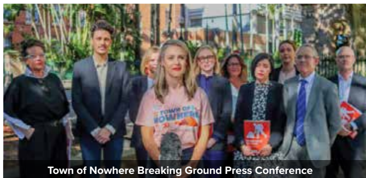
Town of Nowhere Breaking Ground Press Conference

In our continued efforts to collectively campaign as part of a coalition to end homelessness, we are driven more than ever in our effort to help end the state's housing crisis.