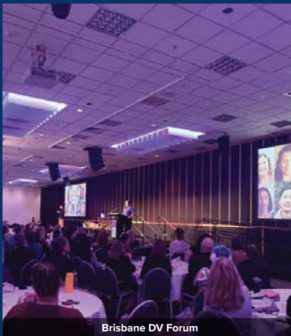
Brisbane DV Forum